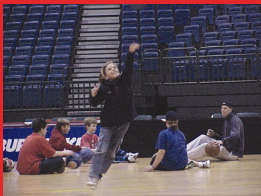
Having fun at a Jr Rams clinic